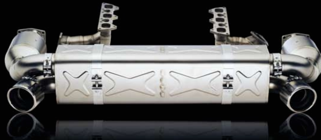
Porsche 997 GT2 Evolution Race System

Hard facts: Titanium, 40,7 HP plus, 73,6 Nm plus, 5,4 kg minus